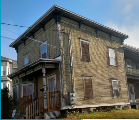
11 Highland Ave House in Barre